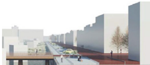
Figure 3 Artist impression of border between pier and estuary

In the new proposal, the old harbors will silt and four new estuaries will arise. This special nature reserves will supply the neighborhood of food and will clean their wastewater. Nutrient cycles are closed at the scale of the neighborhood. The hard concrete piers and soft estuaries create a sharp contrast between city and nature, but are inseparable and connected by a network of public spaces and buildings. This juxtaposition symbolizes the dependence between humanity and nature.