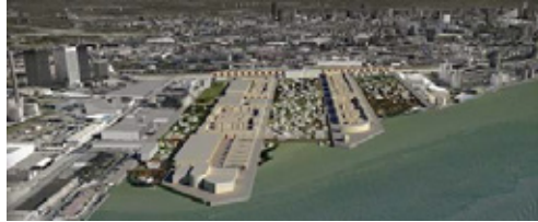
Figure 1 Overview Vierkous

1 Faculty of Architecture and Build Environment, Delft University of Technology